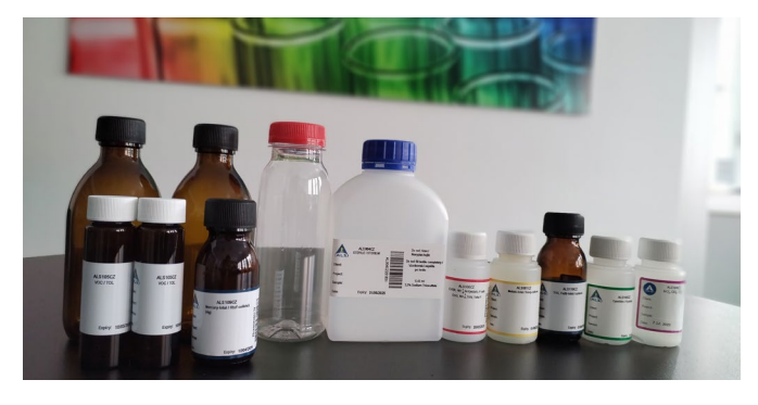
Figure 3: An example of preserved and non-preserved containers.

An important parameter is also the volume/size of the sampling container. ALS laboratories emphasize the miniaturisation of sampling containers. For selected analyses, ALS laboratories use containers of volumes as low as 40 mL, 60 mL, or 100 mL, for instance.